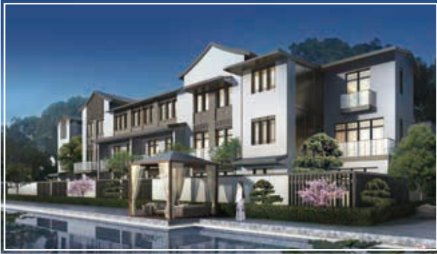
Location: Zhaoling Village and Caodian Village, Mihe Town, Gongyi City.