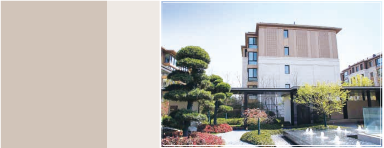
Zhengzhou Zensun Longhushangjing 鄭州正商瓏湖上境

During the year, the Group acquired lands with market analysis and risk assessment in a prudent manner. For the Group's sustainable and steady development and growth, the Group successfully acquired 10 land parcels at a total consideration of approximately RMB3.888 billion in 2019, contributing approximately 460,000 sq.m. to its land reserves. Property projects, including Zhengzhou Zensun Scholar Garden, Zhengzhou Zensun Longhushangjing, Zhengzhou Zensun River Valley Phase I (Green-view Garden No.1) and Zhengzhou Zensun River Home Phase I (Courtyard No.1), were newly completed and delivered during the year, recognising booked GFA of 542,000 sq.m. with revenue of RMB8.796 billion. The Company has engaged in property development business in China since 2015 and has expanded its land reserves with various property development projects under development and planning. These property development projects are currently on schedule to be developed and delivered. It is expected that they will generate sustainable revenue and profit for the Company in the coming years.