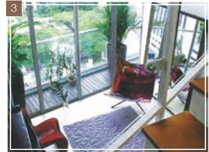
1. Dakota Residences 2&3. Southbank Soho