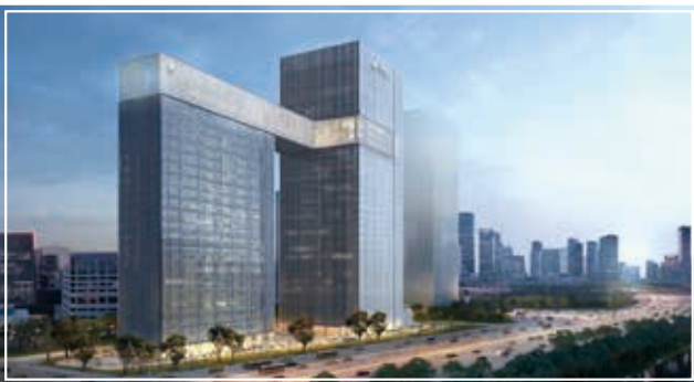
Location: South of Qilihe South Road and west of Jiayuan Road, Zhengdong New District.

正商十里香山匠心打造16平方公里的時代藍圖，是本集團3.0產品的首發之作，首期滿庭芳組團包含花漾洋房、林麓聯排、繽紛商業，項目秉承「建築讓位於自然」的原則，在首批建設中，打造佔地約1,800畝的農業公園，真正是「將家園建設在青山綠水與公園裡」。同時巧妙運用山地形貌、中式文化特色、風俗風情，規劃有「古韻商業、風情社區、兒童樂園、休閒採摘、農耕年華、葡萄莊園」六大主題區，規劃中的文化、旅遊、商業、教育、休閒、度假、療養配套豐富而完備。在保障都市便捷生活的同時，實現與自然歸真生活和諧共融。