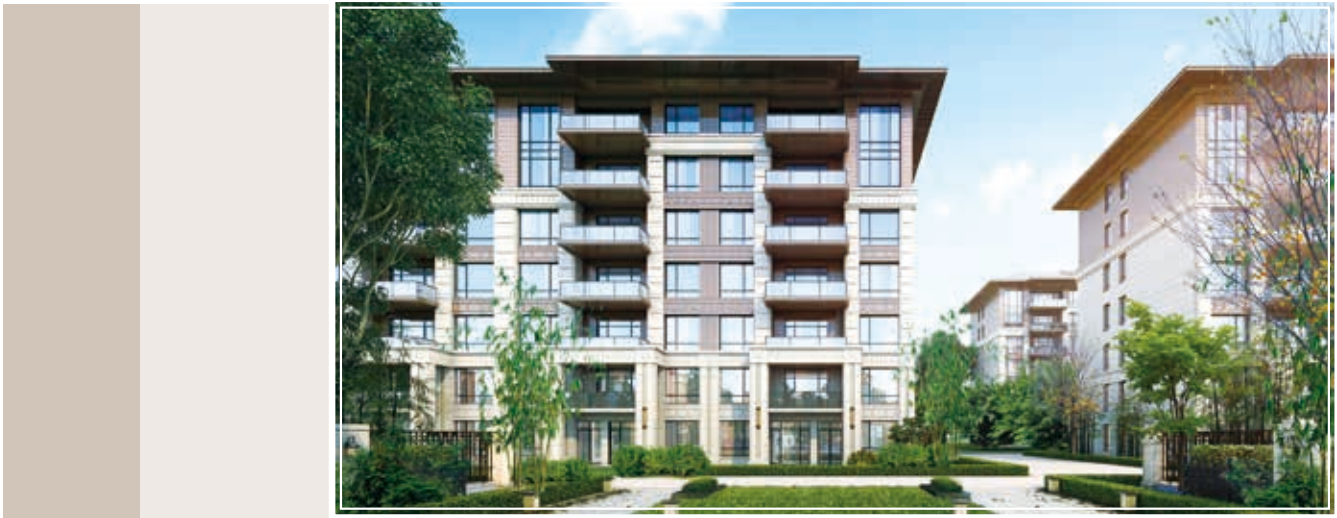
Zhengzhou Zensun River Valley 鄭州正商河峪州

During the year, the Group actively enhanced investor relations and strategically utilised offshore capital market. The financing capability was proved to be effective and further consolidated the capital base of the Group, thus paving a solid foundation for further development of the Group. In August 2019, the Group successfully issued approximately 4.12 billion new ordinary shares to the controlling shareholder at a total subscription price of approximately HK$1.56 billion, which effectively solidified the capital structure of the Group. In January 2019, the Group successfully issued US$100 million short-term bonds. In October 2019, the Company first issued publicly its US$220 million senior notes, which were listed on the Stock Exchange for trading and further issued US$120 million additional senior notes in December. The issuance of such bonds represents milestones in the Group's development in capital market and also shows the investors' confidence in and support to the Group.